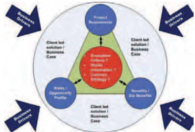
Project Management Innovation: A new 'front end' triangle

The key innovation adopted throughout the project was the development and implementation of ICE.